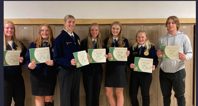
Greenhand Degree Recipients